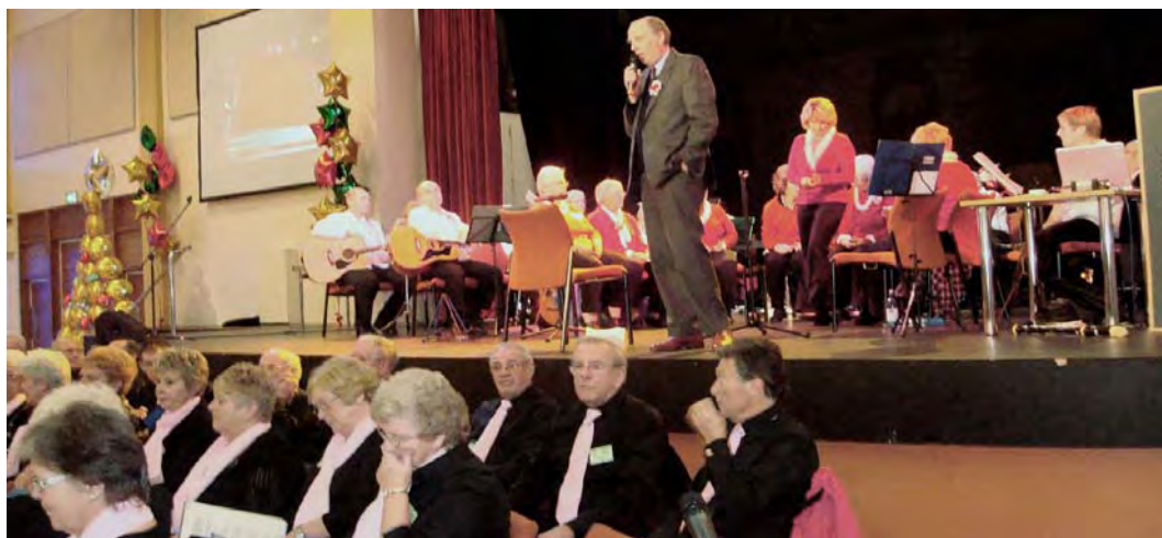
Choir, Orchestra and the Spoons at the Bridlington U3A Christmas Concert 2009