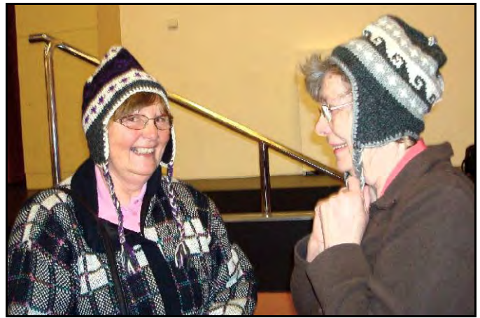
Nepalese Hats for a Bridlington Winter