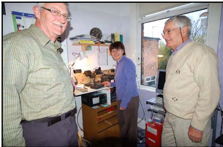
The Amateur Radio Group: 'CQ, CQ,DX this is M1DBB'

Wednesday July 14 th 7-9pm £6 for U3A members-just turn up!