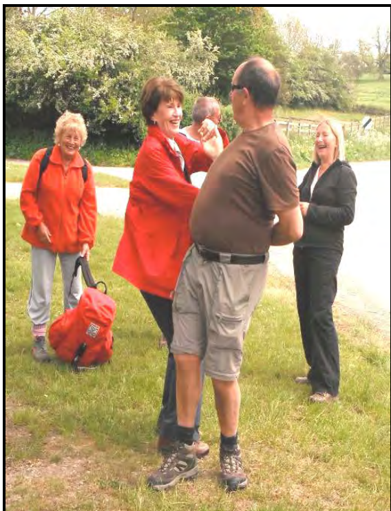
♪ 'Shall we dance? Shall we dance...?' ♪

Variable meeting days: Geology Long Walks Trips Theatre